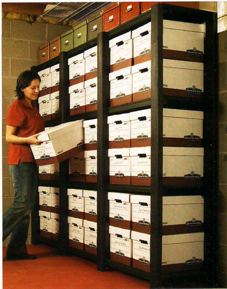
Build sturdy, simple shelves, custom sized to hold boxes or other storage containers.